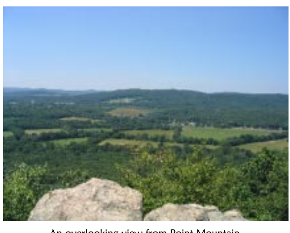
An overlooking view from Point Mountain

Heritage Conservancy 85 Old Dublin Pike Doylestown, Pa 18901 HERITAGE CONSERVANCY 215-345-7020 www.heritageconservancy.org